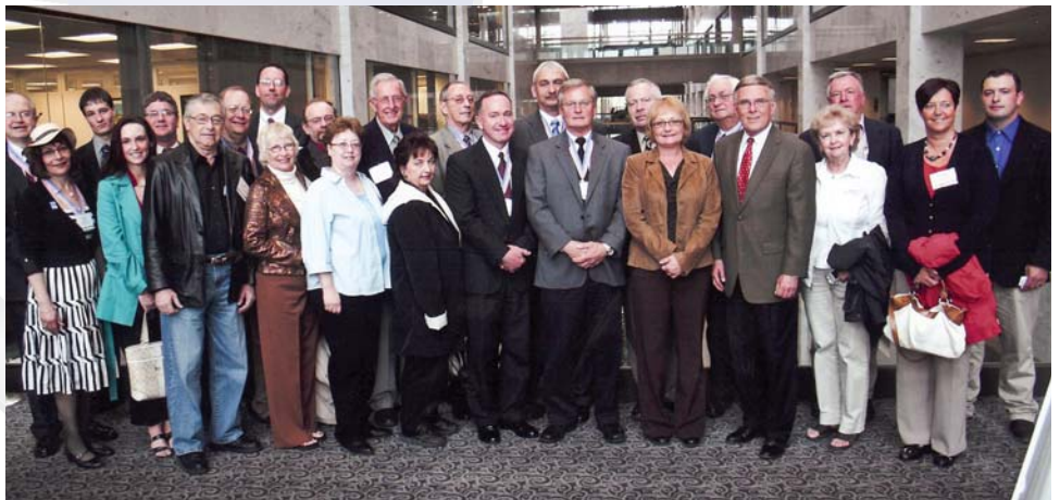
North Dakota Rural Water Association Members with Senator Dorgan at the Rally

You can find out more about the Rally at www.nrwa.org or by contacting AE2S. ■